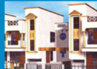
Green Glades-I-II, Greater Noida