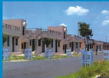
East End, Tronica City, Loni, Ghaziabad