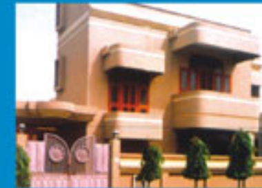
Suryodaya Vihar, Meerut