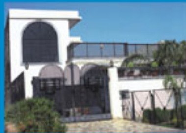
Chiranjiv Vihar, Ghaziabad