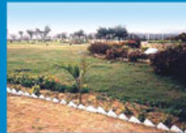
Golden Heights, Sohna