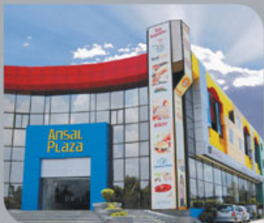
Ansal Plaza, Vaishali, Ghaziabad