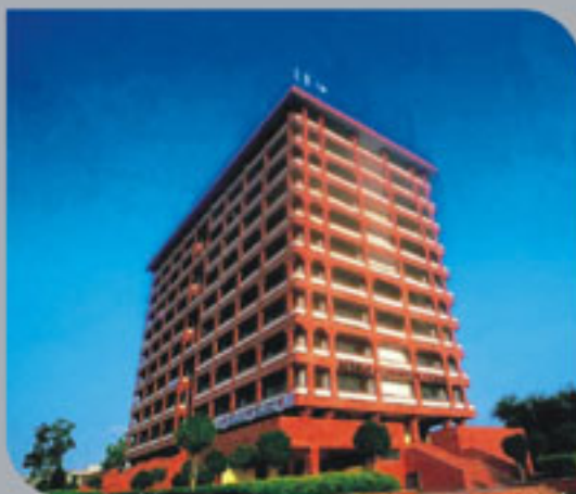
Classique Tower, New Delhi