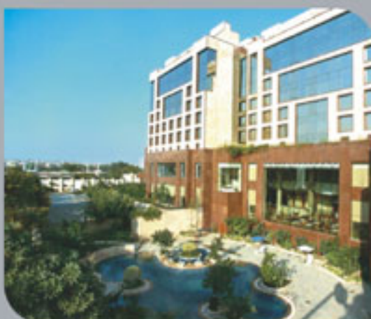
Marriott Welcome Hotel New Delhi