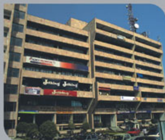
Laxmi Deep - Pragati Deep New Delhi