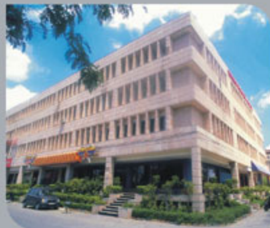
Fortune Arcade, Noida, U.P