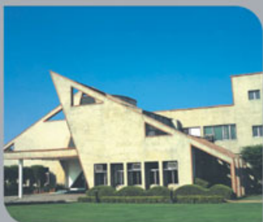
Chancellor Club Ghaziabad