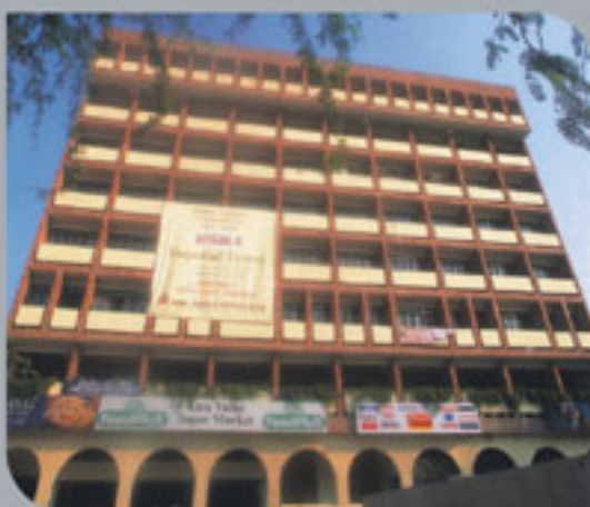
Imperial Tower, New Delhi