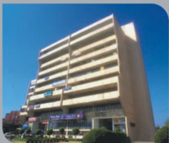
Vikas Deep, New Delhi