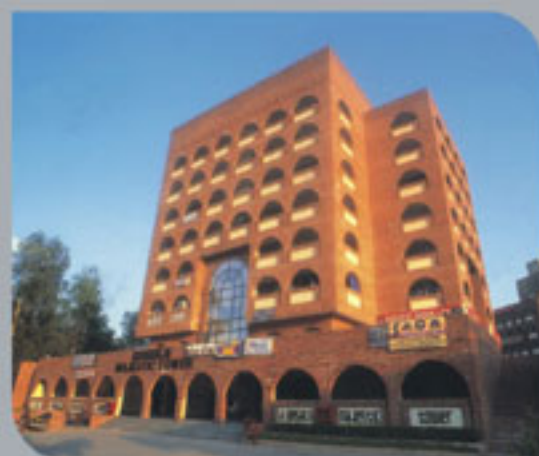
Majestic Tower, New Delhi