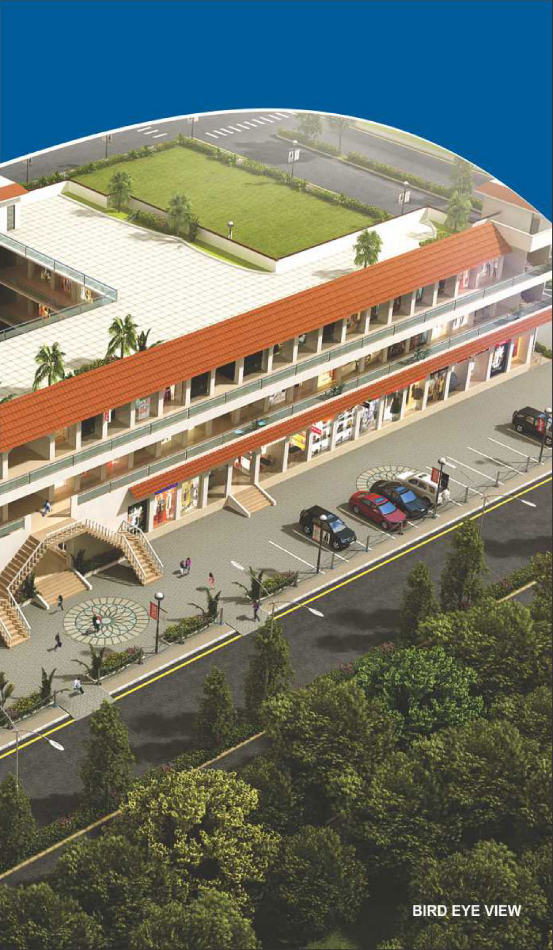
BIRD EYE VIEW