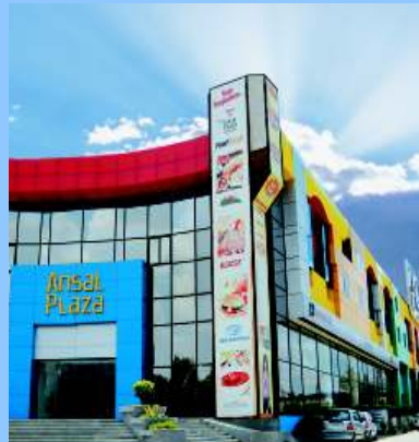
ANSAL PLAZA VAISHALI, GHAZIABAD