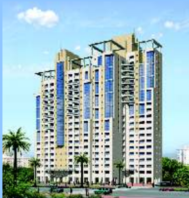
ANSAL HEIGHTS MUMBAI

To know more about the company and its various past and ongoing projects, please log on to: www.ansals.com