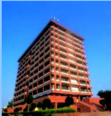
CLASSIQUE TOWER DELHI