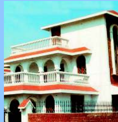
ANSALS AASHIANA LUCKNOW