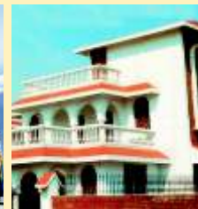
ANSALS AASHIANA LUCKNOW