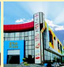
ANSAL PLAZA VAISHALI, GHAZIABAD