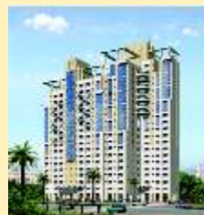
ANSAL HEIGHTS MUMBAI

To know more about the company and its various past and ongoing projects, please log on to: www.ansals.com