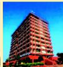
CLASSIQUE TOWER DELHI