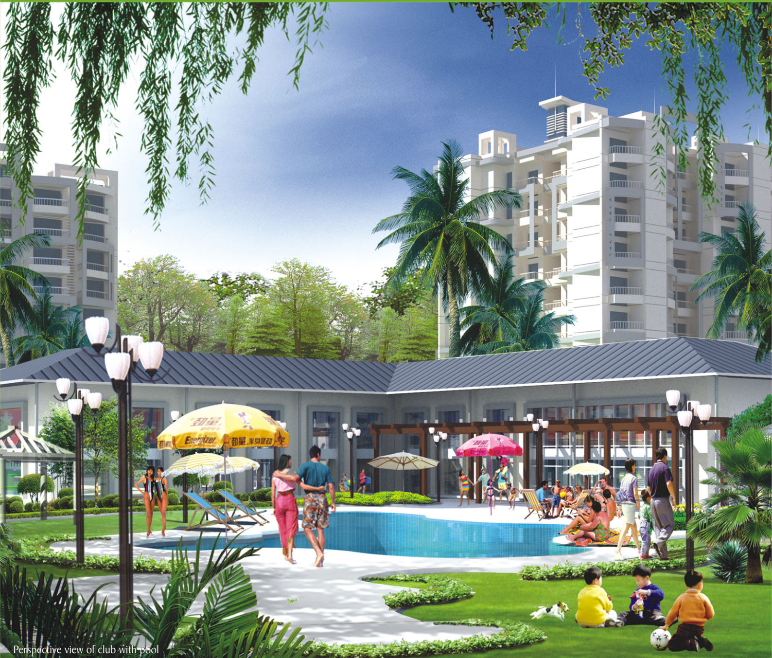
Perspective view of club with pool