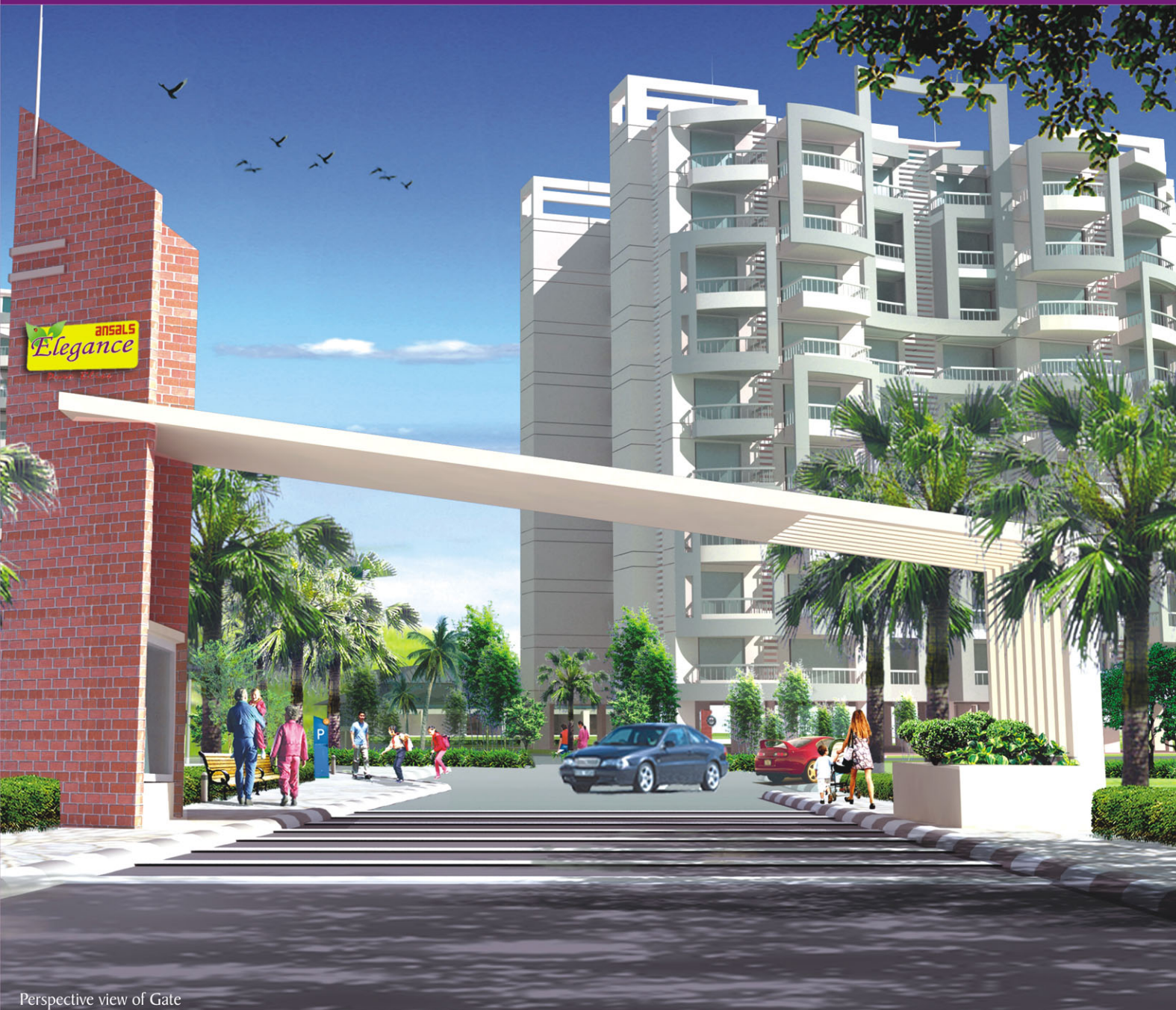
Perspective view of Gate