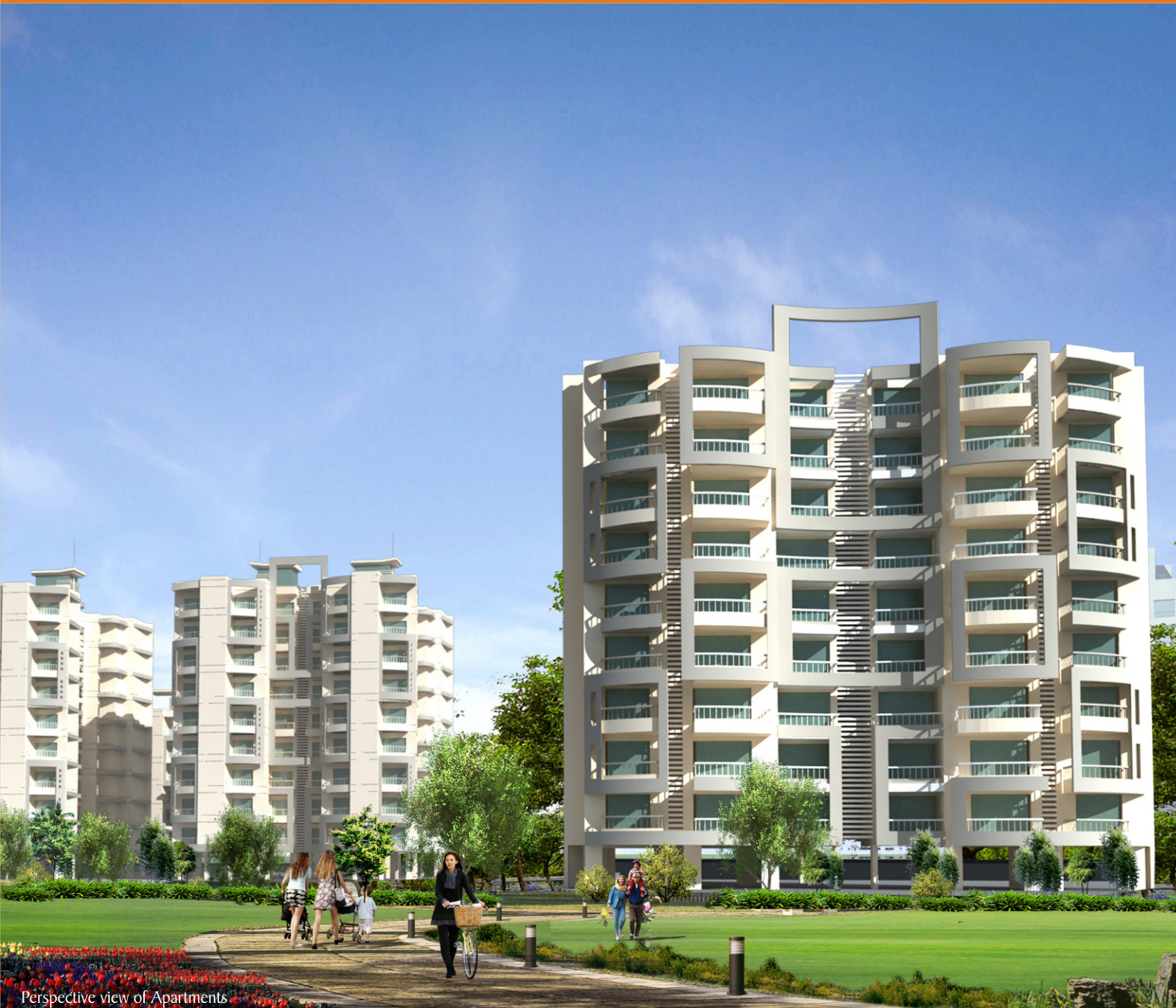
Perspective view of Apartments