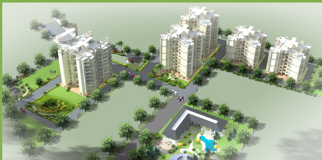
A Bird's Eye View