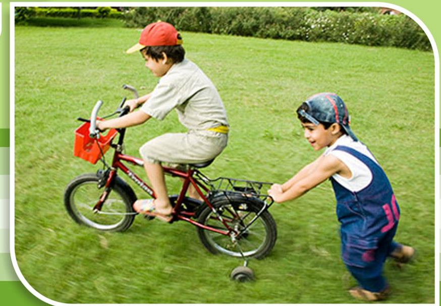
Reference picture only