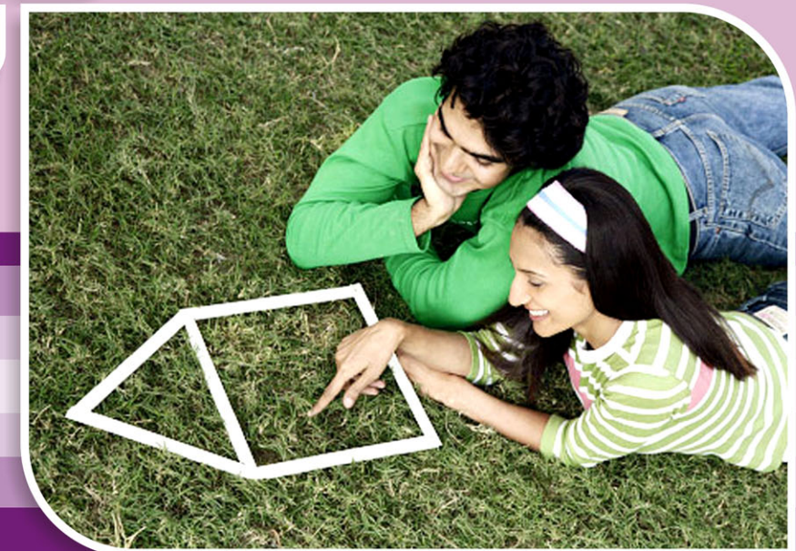
Reference picture only