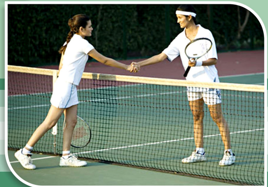
Reference picture only